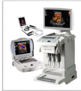
Medical Ultrasound Systems