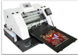
Ink Jet Printers