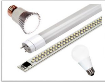
LED General Lighting